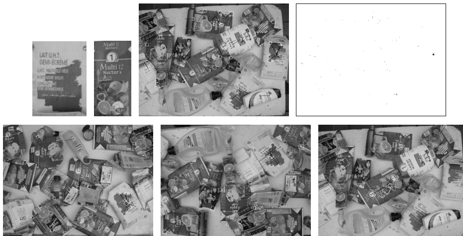
Fig. 3. Some experimental results. Top row: model photos of milk and juice cartons, query image with matching visual words (white) and relative anchor locations (black) for the milk carton, hough space. Bottom row: Two query images with detected milk cartons, one with detected juice carton.

In the middle of the top row, the anchor position voting output is shown for the milk carton detection step. From matched visual words, black lines are drawn towards the anchor position. It is clearly visible that many lines point at the centres of both milk cartons. In the Hough voting space, next to it, this leads to two black spots at the positions of the milk cartons. The bottom row shows comparable experimental results for other query and model images.